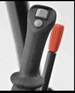
Left control lever

U27-4 is available with a standard AUX1 and AUX2. It enables to further increase machine versatility. The convenient thumb-operated switch on the lever allows easy proportional flow control of the auxiliary circuit.